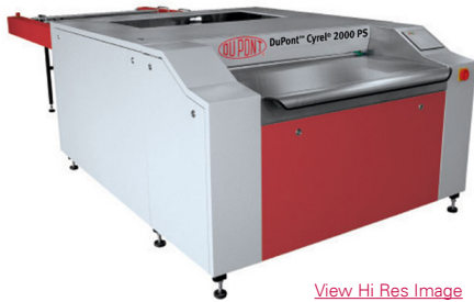
View Hi Res Image