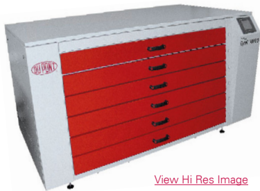
View Hi Res Image