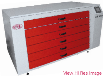
View Hi Res Image