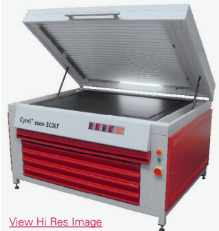
View Hi Res. Image