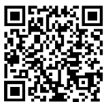
Download latest version

DuPont Packaging Graphics continues to be a global technology leader in the development and supply of flexographic printing systems. Our R&D team continues to develop innovative new solutions to help our customers expand their business by taking advantage of new and profitable opportunities in the growing flexographic packaging market. The DuPont Packaging Graphics portfolio of products includes DuPont™ Cyrel® brand photopolymer plates ( analogue and digital ), Cyrel® platemaking equipment, Cyrel® round sleeves, Cyrel® plate mounting systems and the revolutionary Cyrel® FAST thermal system .