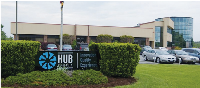
Hub Labels facility in Hagerstown, Maryland