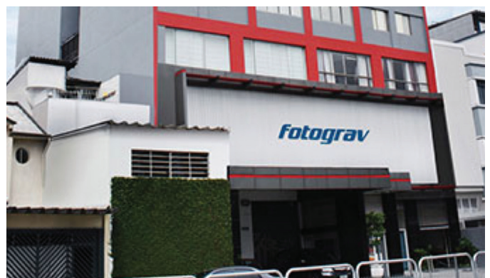
Front of the building where is located the headquarters of Fotograv in Barra Funda, São Paulo

The market knows the Flat Top Dot plays an important role in sustaining dot shape. It ensures better stability on press, allowing higher speeds in a machine and achieving high quality standards. In order to achieve these standards, systems such as lamination, inert gas insertions and special UV lamps were widespread. These are systems Fotograv owns. In addition, software, lens and screenings have been developed, specifically to increase ink density and improve the highlight areas that contributed to increasing the final output of flexographic printing. However, all resources combined dramatically reduce the productivity of the trade shop, resulting in additional costs to some of these systems. Fotograv felt the need to find a definitive solution to this.