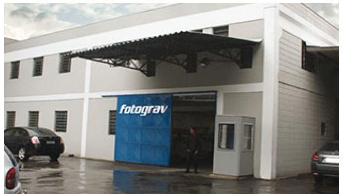
Fotograv Output Center Unit, Carapicuíba – São Paulo

their current processes, they were still missing a simplification in prepress that could maintain or even surpass the level of quality required. They also needed a solution that enabled them to minimize process time and variables involved in the platemaking steps.