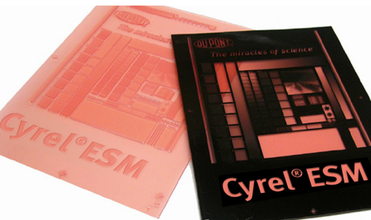
DuPont™ Cyrel® EASY ESM

Built-In Flat Top Dot, High Ink Transfer Digital Plate