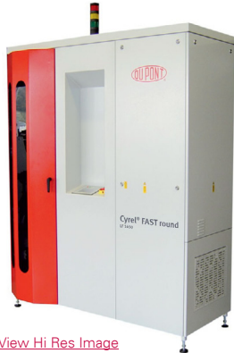
View Hi Res Image