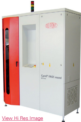
View Hi Res Image