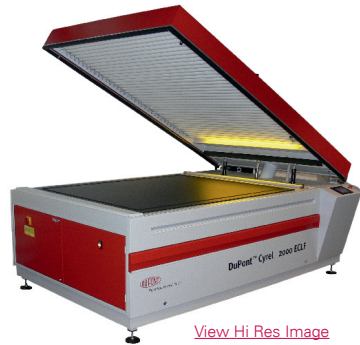
View Hi Res Image