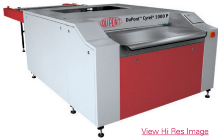
View Hi Res Image

DuPont Packaging Graphics continues to be a global technology leader in the development and supply of flexographic printing systems. Our R&D team continues to develop innovative new solutions to help our customers expand their business by taking advantage of new and profitable opportunities in the growing flexographic packaging market. The DuPont Packaging Graphics portfolio of products includes DuPont™ Cyrel® brand photopolymer plates ( analogue and digital ), Cyrel® platemaking equipment, Cyrel® round sleeves, Cyrel® plate mounting systems and the revolutionary Cyrel® FAST thermal system .