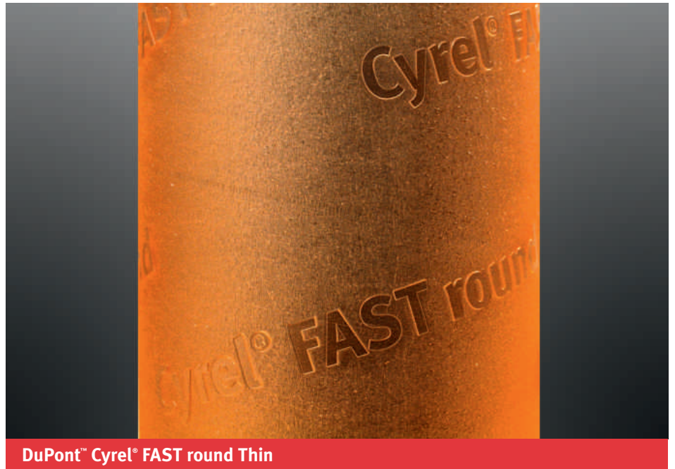
DuPont™ Cyrel® FAST round Thin