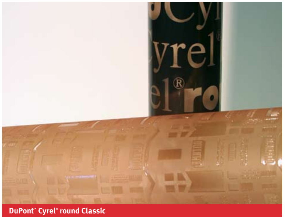
DuPont™ Cyrel® round Classic