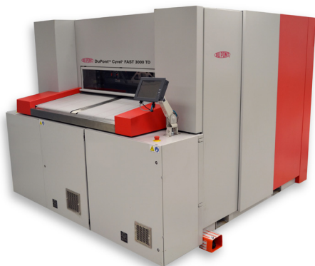
DuPont™ Cyrel® FAST 3000 TD

Large Format, Solvent-Free, Flexographic Plate Processor